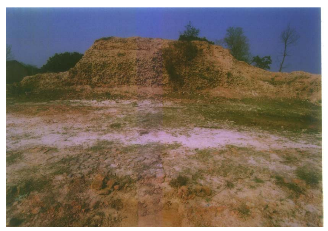
Ancient Mound at Postan (Mound No.1)