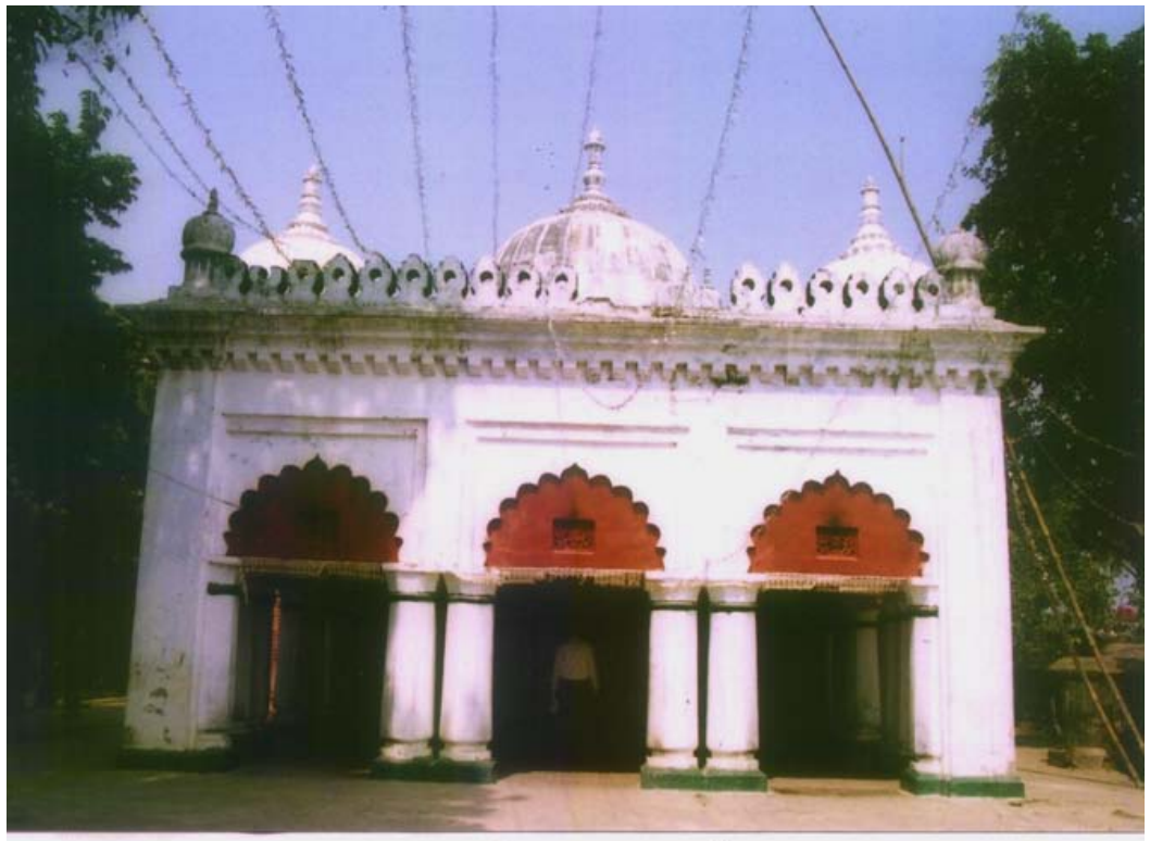
Lohna Durga temple