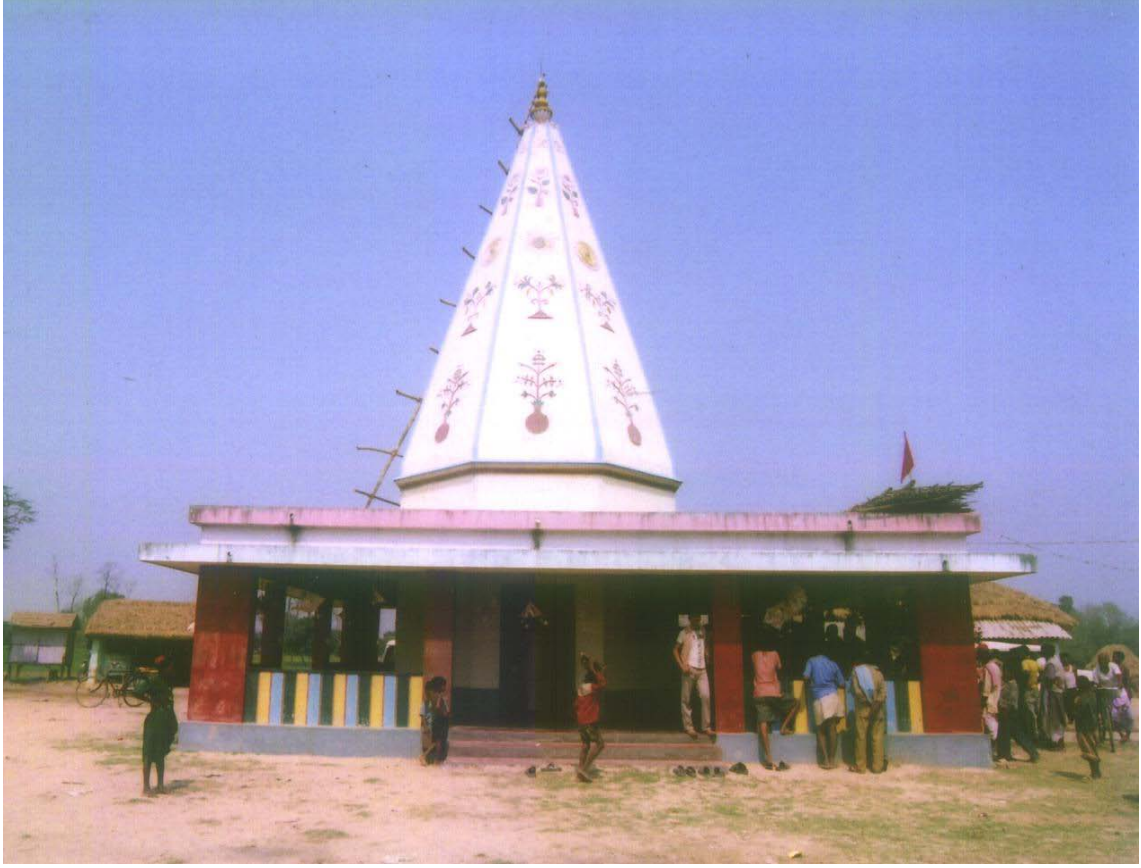
Sun Temple at Parsa