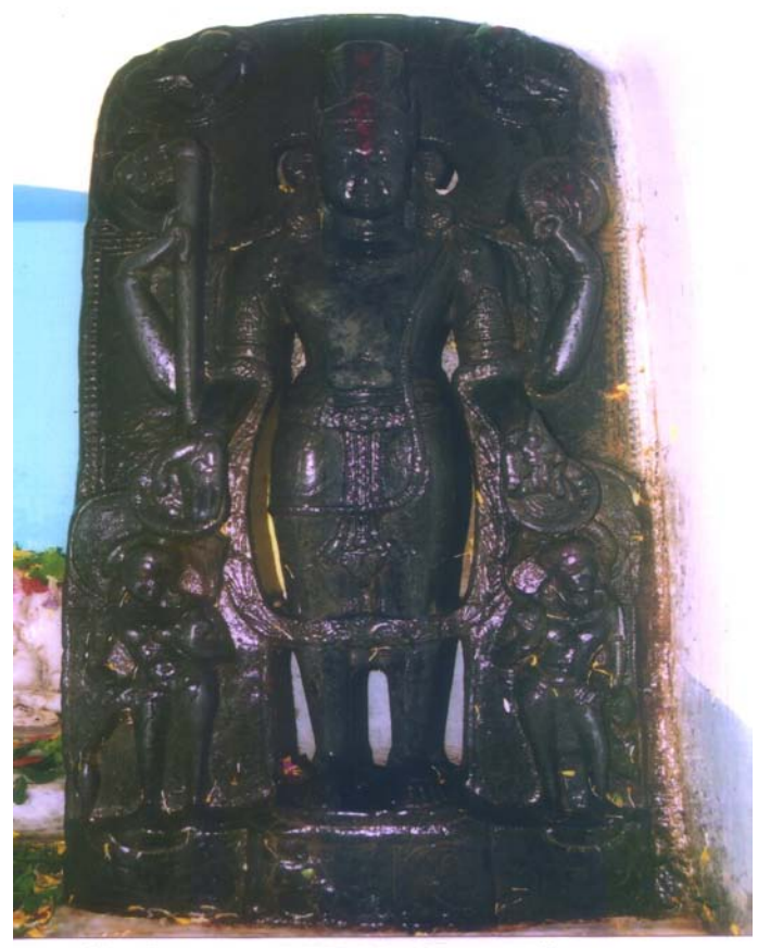
Sculptures of Bideshwarsthan