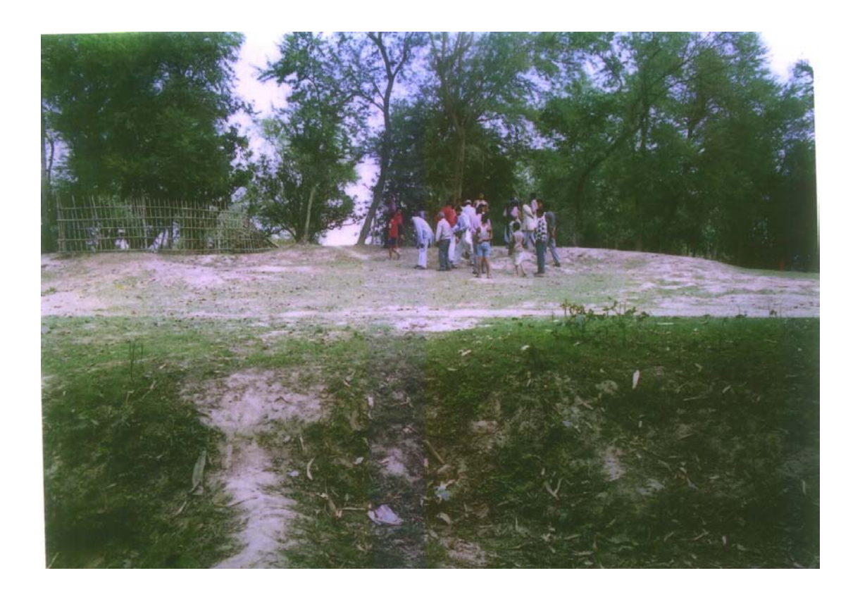
Ancient Mound at Lohna